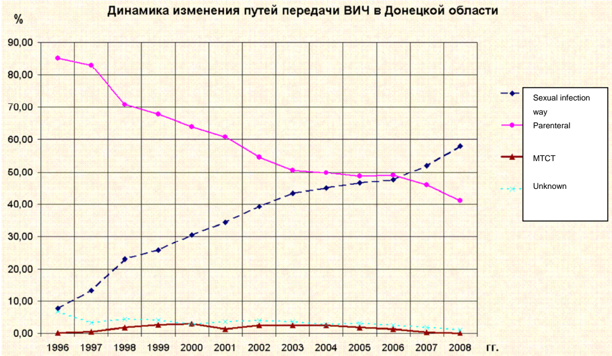
FIG 3: DYNAMIC OF THE CHANGE OF HIV INFECTION WAYS IN THE DONETSK OBLAST, 1996-2008

(Donetsk Society of assistance for the AIDS infected, www.aids.donetsk.ua )