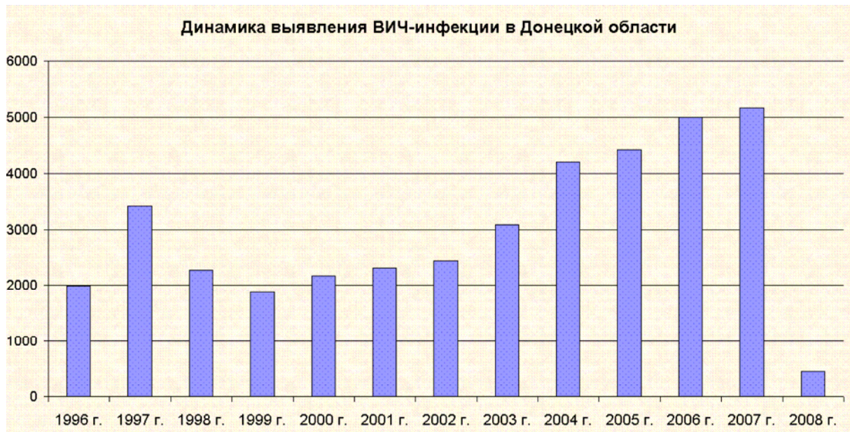
FIG 1: DYNAMIC OF THE HIV INFECTIONS IN THE DONETSK OBLAST, 1996-2008

(Donetsk Society of assistance for the AIDS infected, www.aids.donetsk.ua )